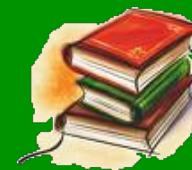
One Book= $3.50