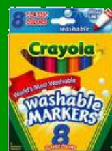
Marker Pack= $2.25