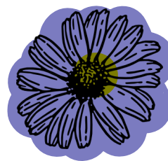
small purple cosmos