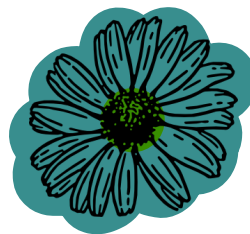
small green cosmos