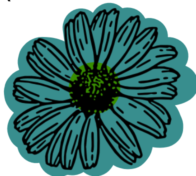
BIG green cosmos

(Remember, look at the SHAPE , size and color !)